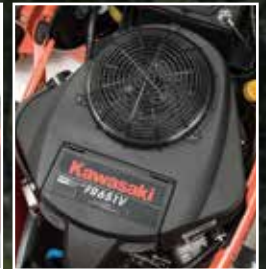
T2290 model (Powered by Kawasaki® engine)