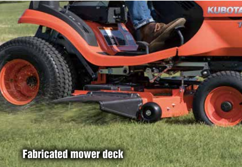
Fabricated mower deck

Step up to the Kubota T Series and get more of everything you want in a premium lawn tractor. More comfort to keep you relaxed and refreshed. More convenience to make the job easier. More efficiency to get the job done fast. And, of course, more Kubota dependability and durability to keep your T Series doing what the T Series does best: making your lawn look great.