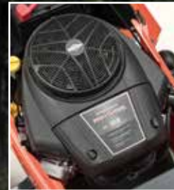
T2090 model (Powered by Briggs & Stratton® engine)

Rugged and dependable gasoline engines have plenty of power to get you up the hill without stalling. Both the T2090 and the T2290 have powerful 2-cylinder V-twin engines.