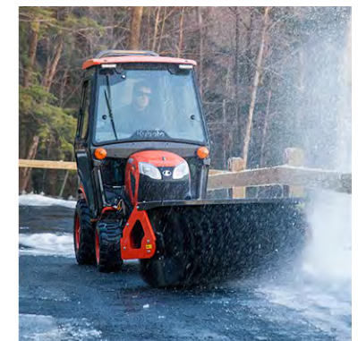
CAB (Snow Broom Shown)