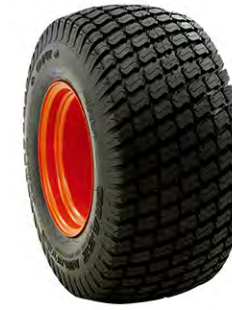
R3 TURF (All models)