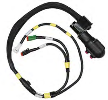
THIRD FUNCTION VALVE