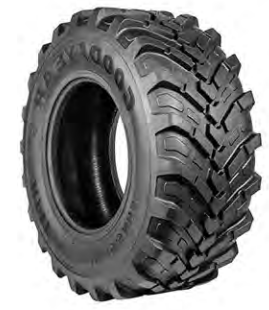
R14 HYBRID (BX2380, BX2680, BX23S only)