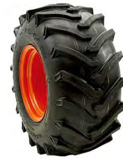
R1 BAR/AGRICULTURAL (BX1880, BX2380, BX2680 only)