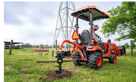
POST HOLE DIGGER