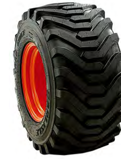
R4 INDUSTRIAL (BX2380, BX2680, BX23S only)