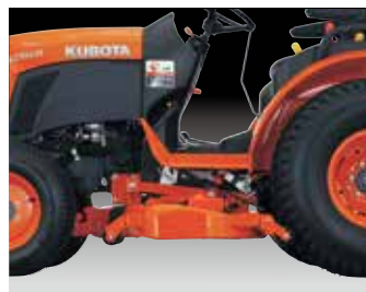
Cutting Height Adjustment Dial Suspended Mower Deck