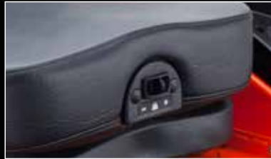
Suspension Seat Adjustment Button

The ZD1500 takes comfort to the next level with a new bucket seat. It features air-suspension that can be adjusted with the touch of a button for supremely soft support and gentle comfort that lasts until the job is done.