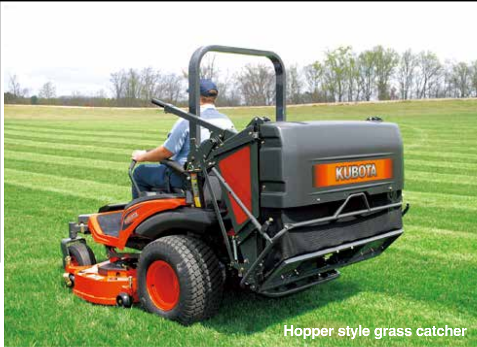
Hopper style grass catcher