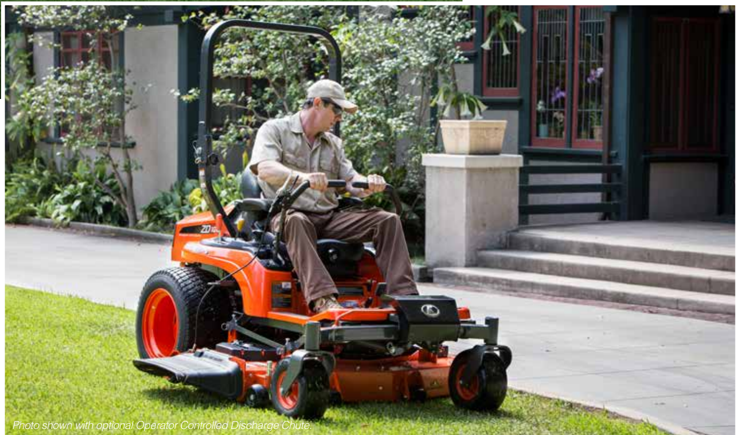
Photo shown with optional Operator Controlled Discharge Chute.