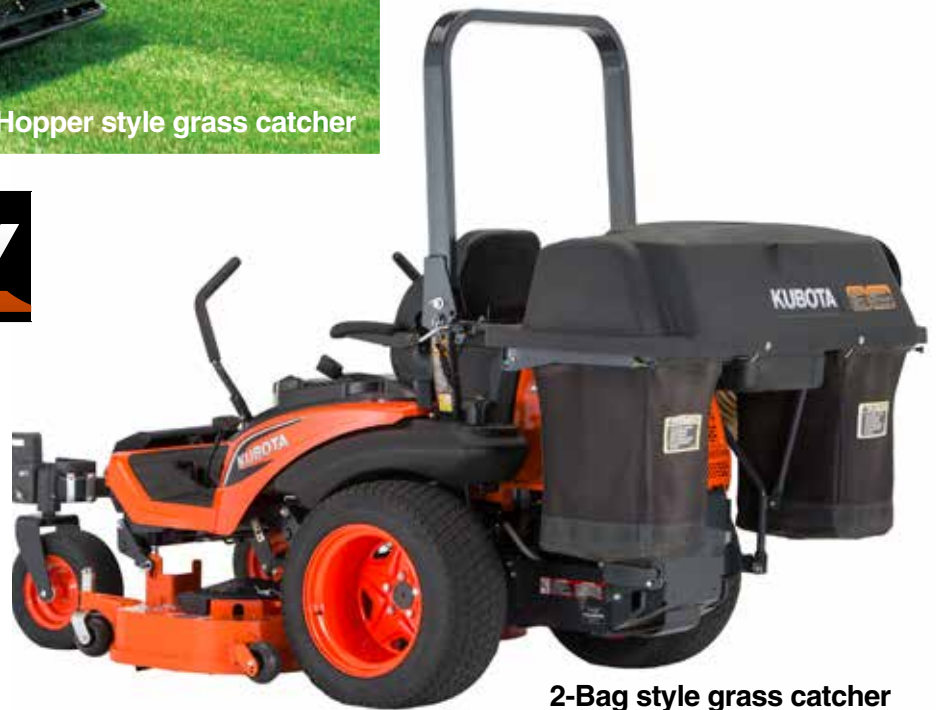
2-Bag style grass catcher